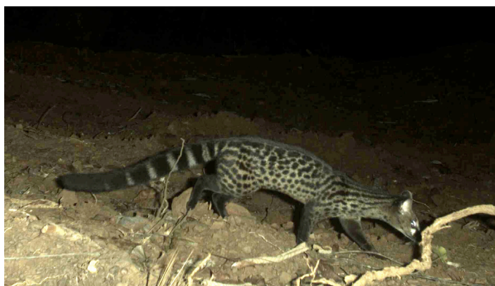
Fig. 5. Bourlon's Genet Genetta bourloni , Putu Iron Ore Mining concession, Liberia.

(one species) and Nandiniidae (one species), were identified. Of particular note, the PIOM concession supports a population of the poorly-known, newly-described Bourlon's Genet: camera-trapping produced the first known images of wild-living individuals.