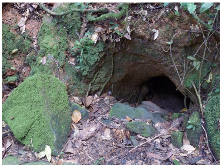
Fig. 3. Honey Badger Mellivora capensis den, Putu Iron Ore Mining concession, Liberia.

Honey Badger was confirmed by camera-trapping at only one location – a den site – on the eastern slope of Mt Jideh, in closed-canopy forest close to a stream. This specific site was chosen after the author encountered the burrow by chance (Fig. 3), and shone a torch down it. This elicited a series of fierce rattling growls, which is typical defensive behaviour of Honey Badger. Forest-dwelling individuals in Central Africa have been