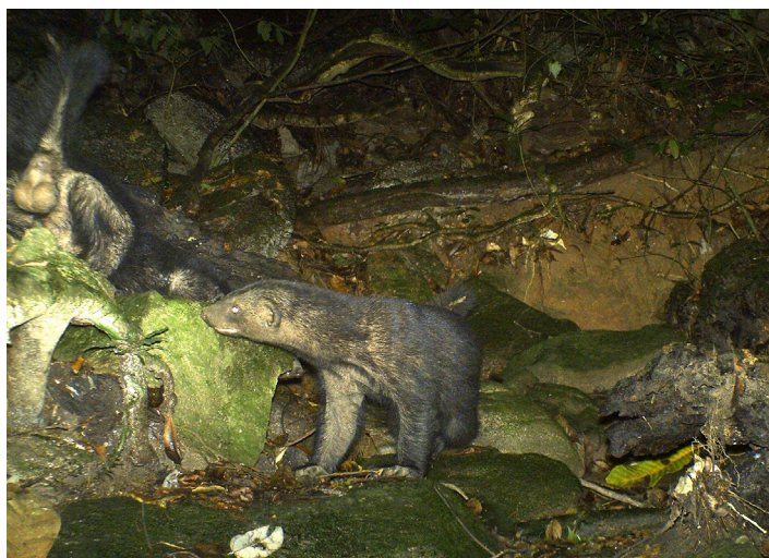
Fig. 4. Honey Badger Mellivora capensis social behaviour (olfactory communication), Putu Iron Ore Mining concession, Liberia.

reported as being all black (Hunter & Barrett 2011, Bahaa-eldin et al. 2013): this was apparent in the images (Fig. 4).